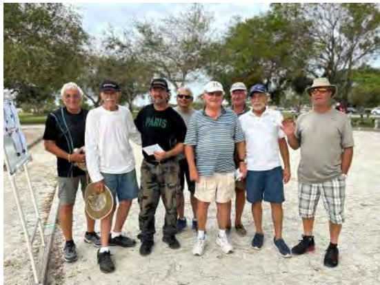
Club Championship Finalists

News from South Florida Pétanque Club , where " Friends, Fun & Pétanque " is our motto! In 2023, we enjoyed over 2,400 games at John Prince Park , with an average of 28 players per game. Our regular play days on Tuesday, Thursday, and Sunday have been a hit, with $3 entry fees for three games and computer-selected teams ensuring fair play.