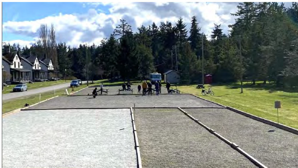
Port Townsend courts

For those wishing to participate in the Men's WC, we encourage you to make lodging reservations as soon as possible. Port Townsend is a popular tourist destination during the summer weekends, and because they are located on a peninsula, nearby lodging can be limited. Please note that the nearest airports are Seattle-Tacoma International Airport (SEA- Seattle/Tacoma Intl.) and Everett (PAE- Seattle/Everett). Both are about a 2-hour trip from Port Townsend, either by car, or by ferry boat and car. Port Townsend looks forward to welcoming you! Link to Men's Doubles WC registration form.