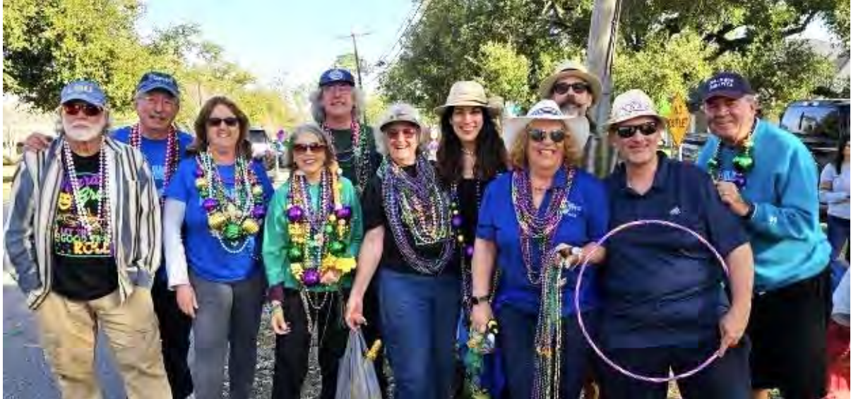
Mid-America & Southeast members at the Mardi Gras Open (p. 23)