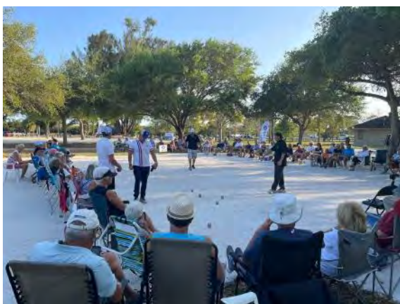
World Championship Qualifier (2023)