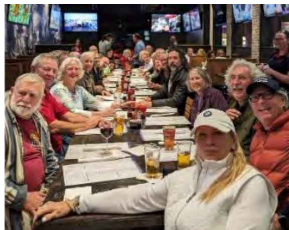
Taking a break from the rain with Cajun fare

The event concluded with a gumbo lunch and a local Mardi Gras parade , where participants were showered with Mardi Gras treasures. The event was a successful and memorable experience that celebrated the spirit of Mardi Gras and the camaraderie of the pétanque community.