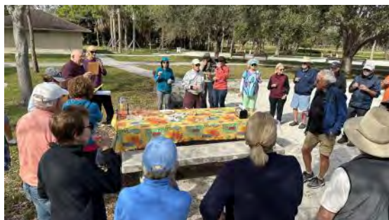
Monthly Birthday Celebration

introduced Speed Dating tournament, a fun, fast-paced format, while February's events included the Singles 4-Boules and Valentine's Day tournaments.