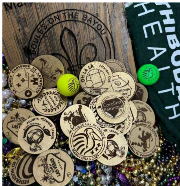
Beautifully crafted Mardi Gras doubloons & cochonnets

The Mardi Gras Open 2024 , hosted by the Thibodaux Pétanque Club , was a vibrant and spirited event that brought together twenty teams from thirteen clubs across seven states for a Select Doubles competition. The festivities began on February 2nd with players enjoying the beautiful day in Peltier Park and indulging in flaming crepes to celebrate La Chandeleur . Despite the clear skies, rain was anticipated for the following day, but spirits remained high as participants received swag bags filled with event-themed items, including engraved cochonnets and Mardi Gras doubloons . When rain came, the Thibodaux Regional Hospital System donated towels, hot beverages, snacks, and king cakes, while club members contributed homemade treats. As the rain persisted, play was suspended for the day, but the camaraderie continued at a local sports bar where the "Boules on the Bayou Krewe of Pétanque" enjoyed a dinner of seafood and Cajun fare.