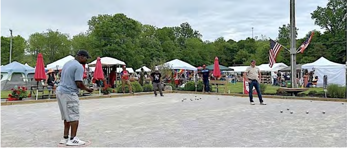
Zanesfield Petanque Club