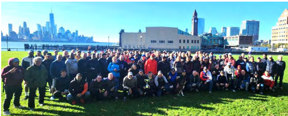
U.S. Open (2023)

Thanks to tournaments hosted by our friends at Brooklyn's Local 718 Pétanque , our members are keeping their skills honed through the winter months, and are looking forward to LBNY's upcoming tournament season. Scheduled to kick off in April , we'll be playing in Bryant Park and Prospect Park . We're particularly excited to host the Women's Triples World Qualifier in September , and to close out the season in early October with our annual US Open of Pétanque , to take place in Hoboken .