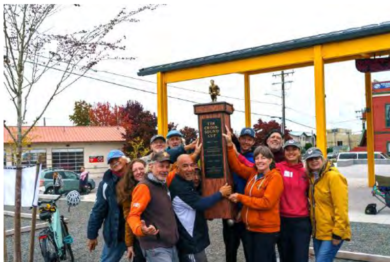
The winning Port Townsend team hoists its Cross-Sound trophy