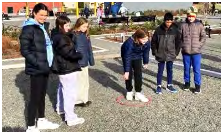
UPrep 6th graders on the courts

EPC also modeled community giving by having raised $12,000 for the Food Bank from their 12th annual Food Bank Tournament in Fall 2023. Congratulations to EPC on this very successful fundraising event!